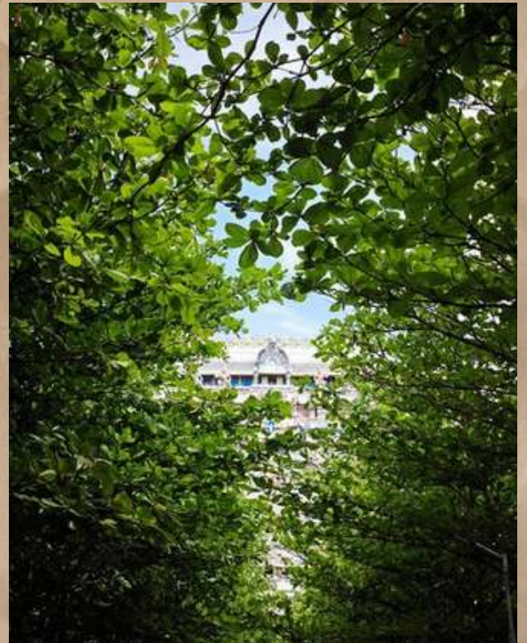
HARIPRASAD K SRO0738956